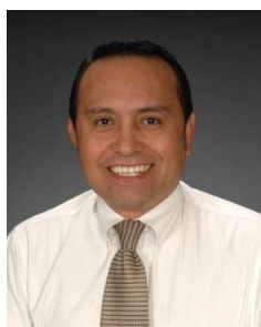
Antonio Carrillo Cemanahuac Educational Community Scholarship in Cuernavaca, Mexico